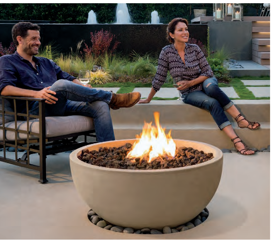
Infinite" Fire Bowl in Oyster Shell with a Honed Finish

Distinguished by craftsmanship, accentuated by firelight and designed to gather round, Kindred Outdoors & Surrounds creates memorable spaces that bring people together through thoughtful composition and functionality. With hand-forged fire bowls, fireplace surrounds and outdoor kitchens, friends and family can commune, converse, and unwind in comfort both inside and outside of the home.