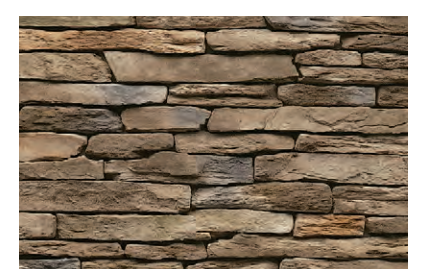
Lauren Cavern Ledge