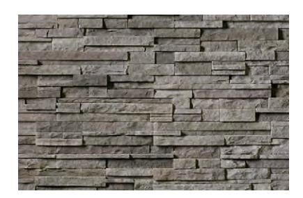
Pro-Fit® Alpine Ledgestone