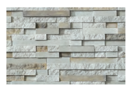
Pro-Fit® Terrain™ Ledgestone