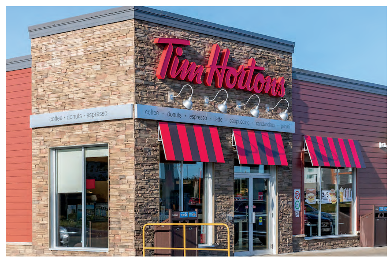
Versetta Stone Tight-Cut Style in Terra Rosa