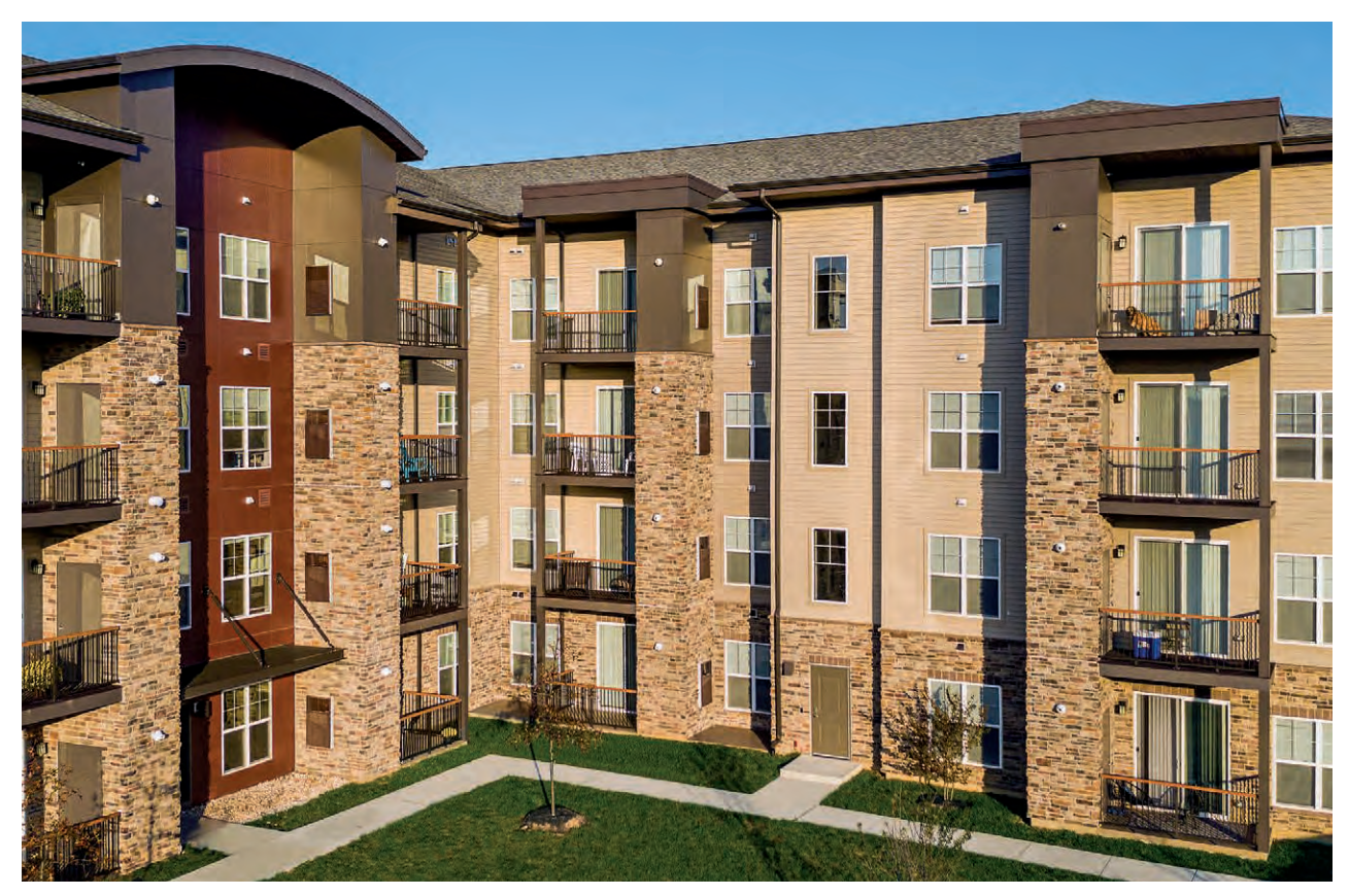
StoneCraft Ledgestone in Chardonnay & Tennessee

Our commitment to craftsmanship can be seen within every textural detail, countless hours spent hand-chiseling each and every natural stone before it was carefully replicated through our proprietary mold techniques. At StoneCraft we honor the masonry traditions of the past and promise to deliver quality and affordability with every stone we make.