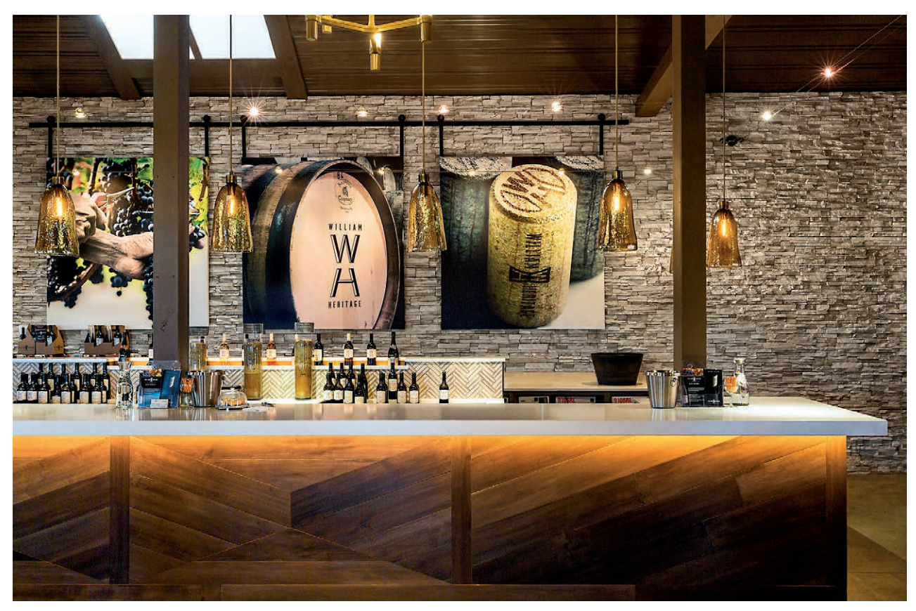
Eldorado Stone Stacked Stone in Daybreak

For more than 50 years, Eldorado Stone has pushed the boundaries of possibilities; harnessing nature's power and creativity to design a collection of premium architectural stone and brick veneer profiles. Handcrafted with artistic colors and expressive textures that verge from traditional to contemporary, Eldorado Stone products offer the ideal backdrop for curating indoor and outdoor spaces that lead to a lifetime of new moments to enjoy.