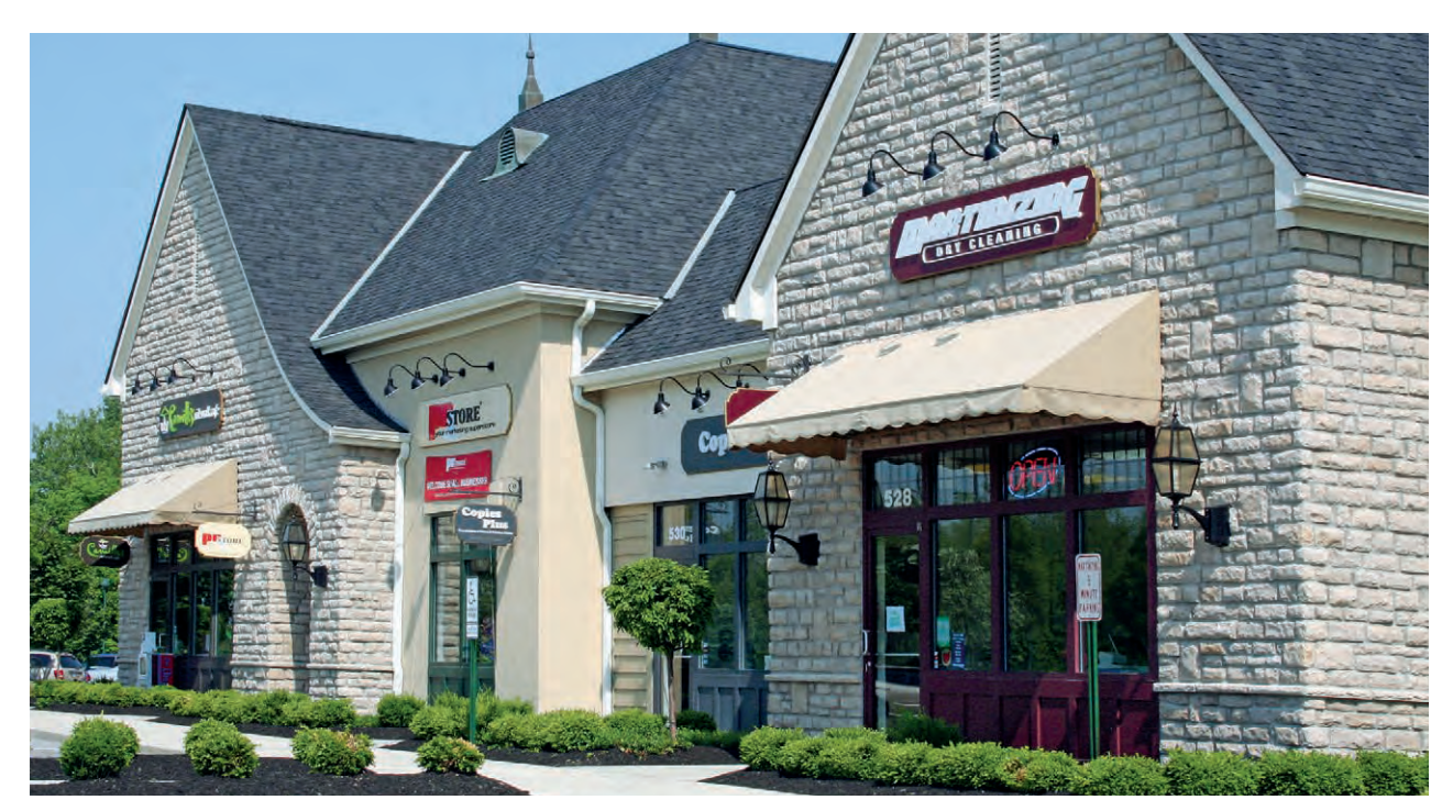
Dutch Quality Stone Limestone in Ohio Tan

Otherwise, it just wouldn't be Dutch Quality Stone.