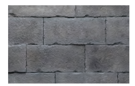
Carved Block Style