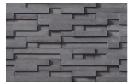
Pro-Fit® Modera Ledgestone