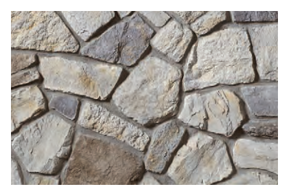
Old Country Fieldstone