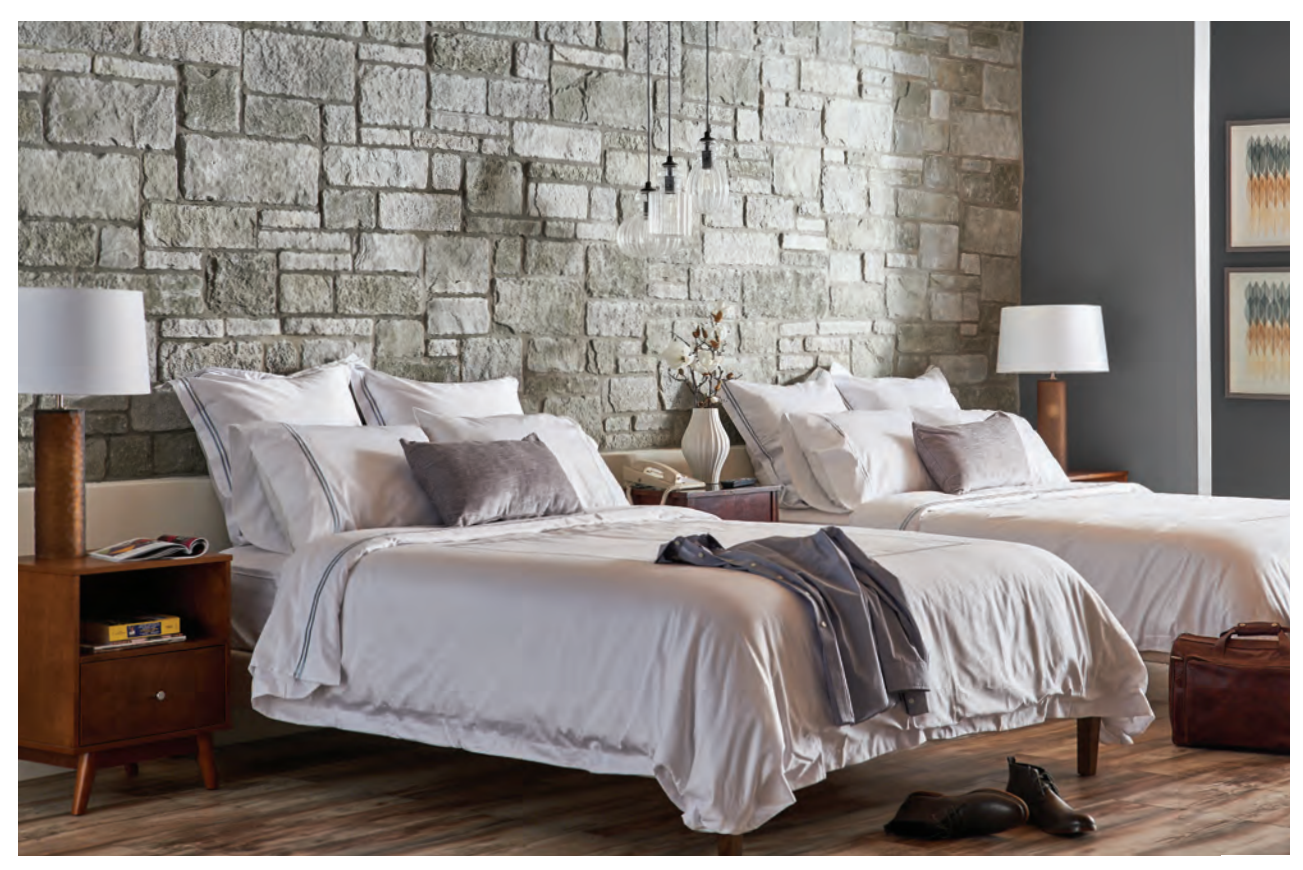
Cultured Stone Sculpted Ashlar in Silver Shore®

Driven by a pioneering spirit, Cultured Stone introduced the world's first architectural stone veneer, making it possible to feature authentic hues and natural textures of stone and brick in any environment. Nearly 60 years later, Cultured Stone continues to lead the industry by creating the finest stone products for empowering the artist within and bringing incomparable designs to reality.