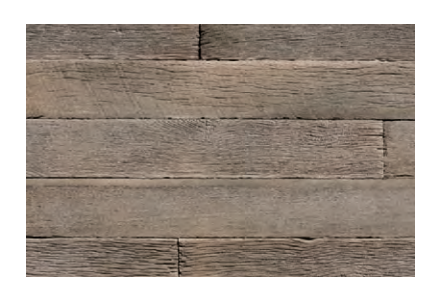
Weathered Plank 4