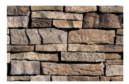
Mountain Ledge Panels