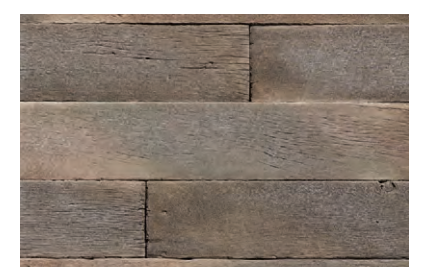
Weathered Plank 6